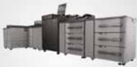
powered by Konica Minolta