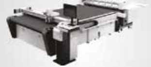
powered by JWEI

The new normal of print will be defined by sudden demands, shorter runs and highly enhanced print products.