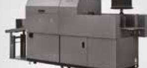
powered by Duplo