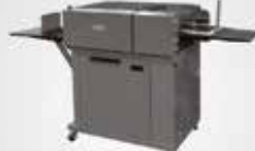
powered by Duplo